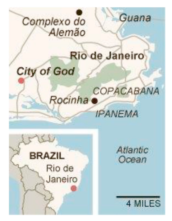
Fig. 1. Map of Cidade de Deus, Rio de Janeiro, Brazil. (Barrionuevo, 2010).