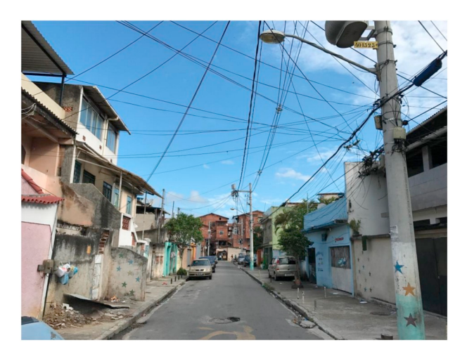
Fig. 2. A neighborhood view of Cidade de Deus.